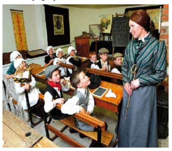
Victorian day: 21st-century schools are still influenced by some elements of 19th-century education structure

The commonly held belief that after 1967 primary schools were swept by a tide of progressivism is untrue. In its 1978 primary survey, HMI reported that only 5 per cent of classrooms were fully 'exploratory' and three-quarters still