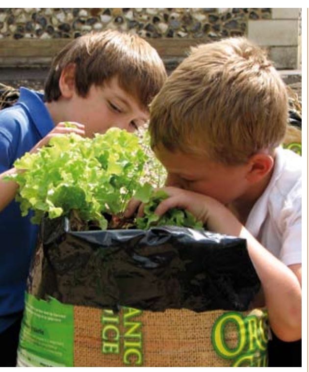
Salad days: pupils are very aware of climate change