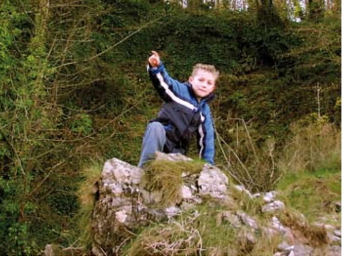
On the up: childhood is a time to be relished for its own sake

Of course, valid concerns remain – about family breakdown, obesity, poor mental health, and lack of space to play. But with so much bleak reporting of childhood, it is important to stress the positive. A recent gain is the growing respect for children as agents, valuable people and citizens in their own right. Children who feel empowered are more likely to be better and happier learners. In recognition of this, the power relations in many schools are beginning to shift, but the picture is still mixed and children are far from uniformly