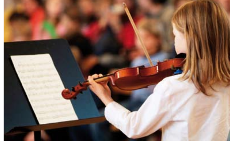
Finding the right note: how can we measure what we value? Should we?

Just as criticising Sats does not equate with opposition to high standards, criticism of the current school inspection system does not imply a refusal to be held accountable. The issue is not whether schools should be accountable, but for what and by what means. By insisting on a