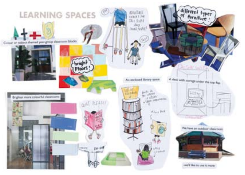
Building their case: creative brief for learning spaces from Essex pupil-clients

Tom Doust is the foundation's education manager. He says: 'It never ceases to amaze me how confident and assertive young people can be. But they are also very pragmatic and modest too. They simply want things to function properly.'