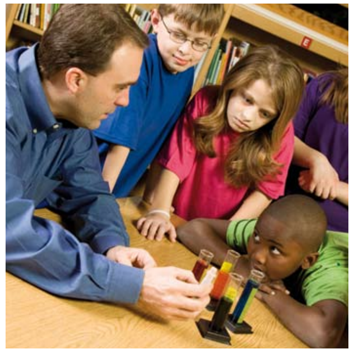
Children and researchers agree: subject expertise really matters

Yet the generalist class teacher system is a legacy of the Victorian age when classes were huge, the curriculum was basic, and teachers were there to drill children in facts and skills. Its great strength was not educational, but financial – it was cheap. But schools have moved on in the past 150 years. Millions have rightly been spent expanding and diversifying the workforce. Classes are smaller and the curriculum has grown and become more complex and professionally demanding. Yet class teachers remain the linchpins. The question must be asked – though governments have proved reluctant to do