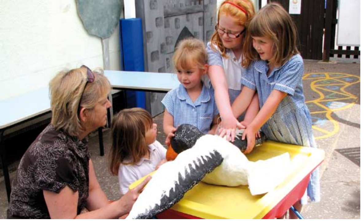
Taking wing: talk - at home and at school - is education at its most elemental and potent

vital realm of classroom interaction that shapes or frustrates children's understanding. The strategies embraced the concept of interactive whole-class teaching with the 'horseshoe' classroom layout that enables all the children to see each other and the teacher. But the focus