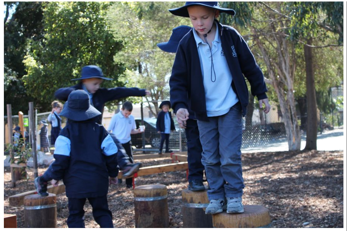
I like to play!