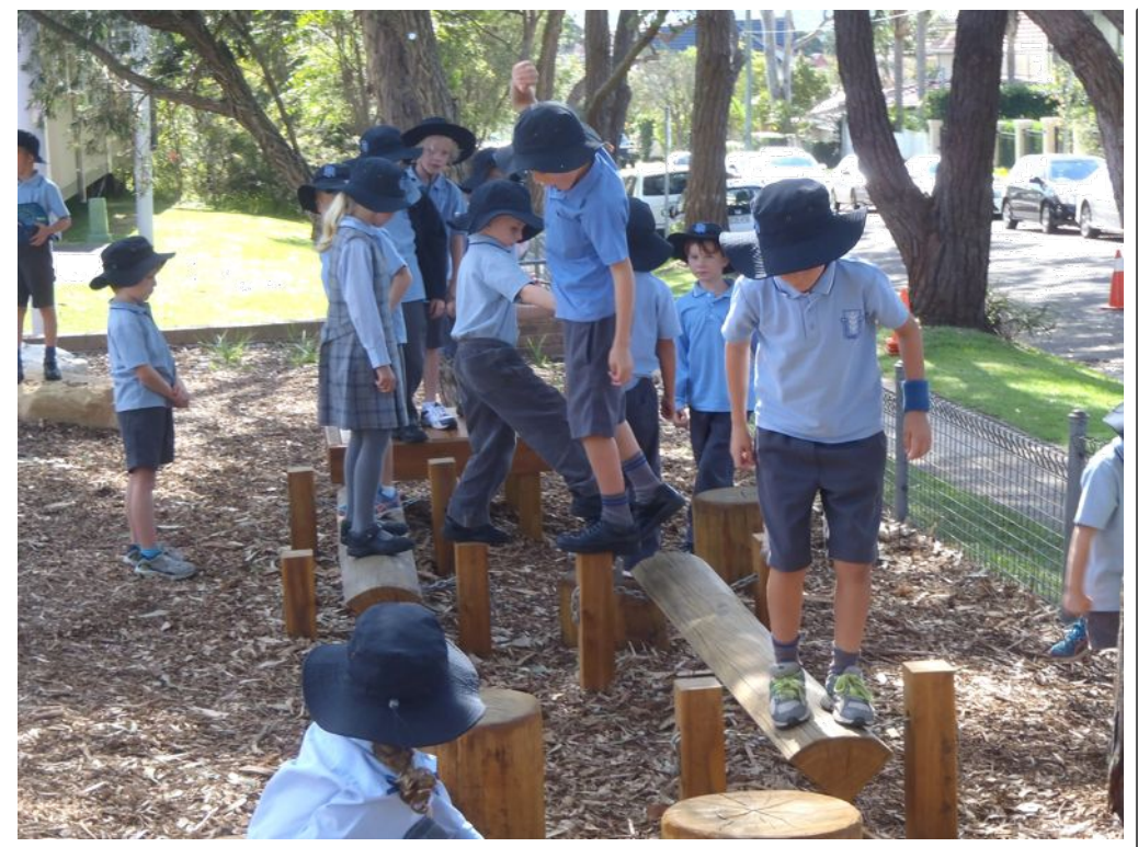
Balance beams and stepping logs constructed from natural materials present challenges and develop coordination and confidence