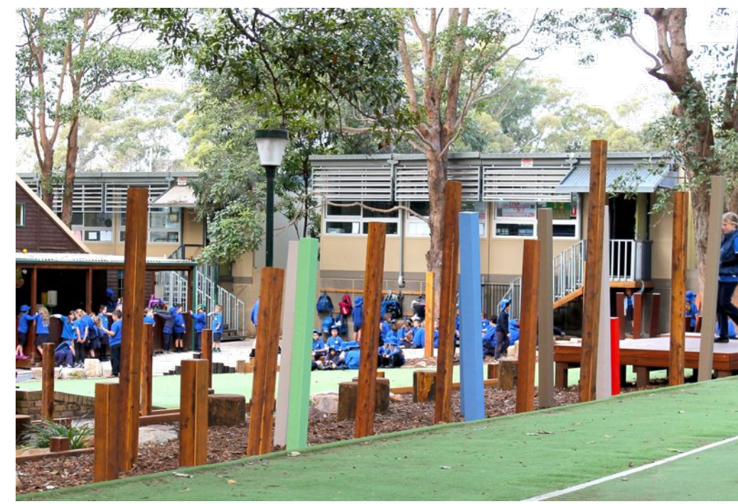
Define spaces with interesting elements made from natural materials