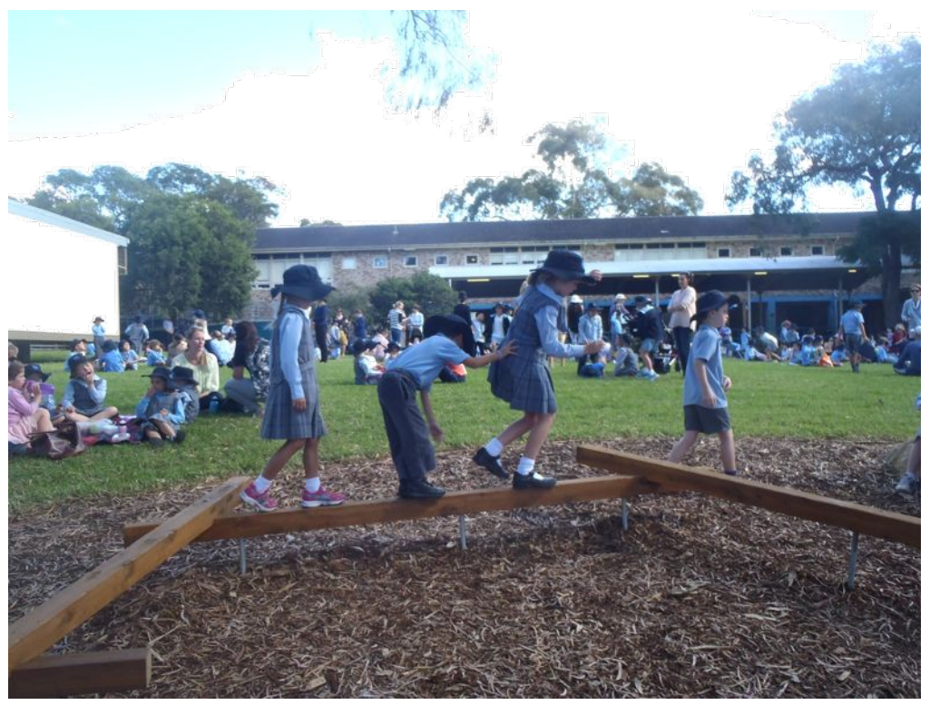
Balance beam circuits promote cooperation and co-ordination between children