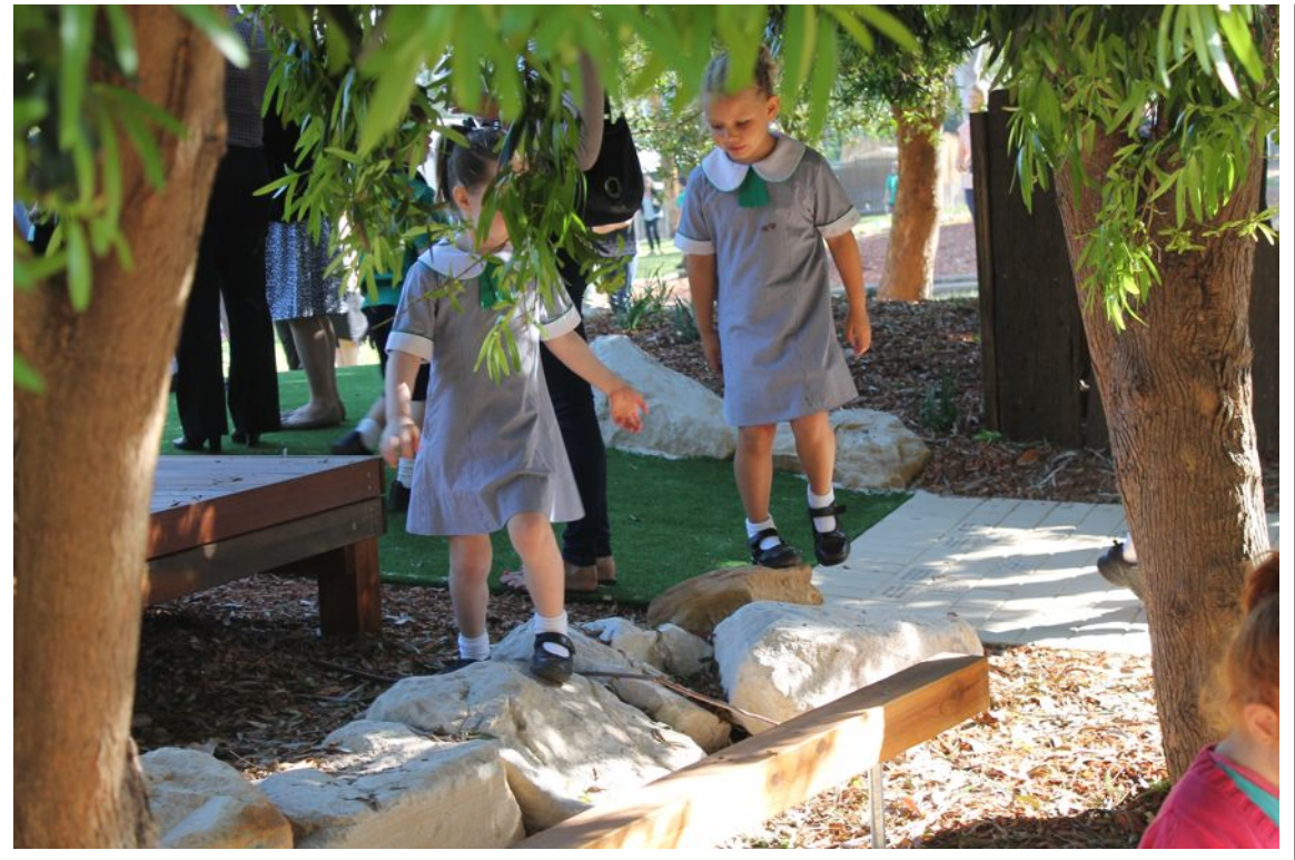
Sandstone is typical of the Sydney region, it is attractive and great for creating interesting edges.