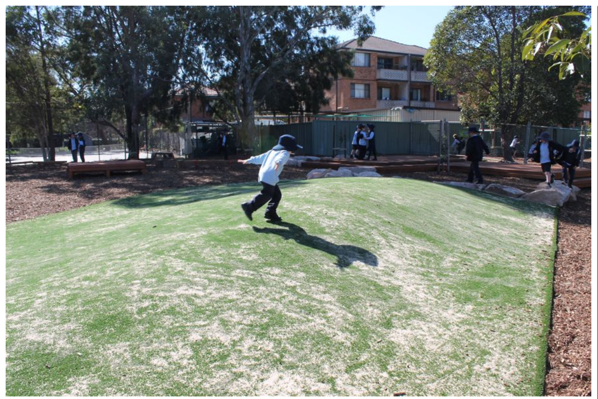
Synthetic grass can be contoured into mounds, adding an extra element of fun