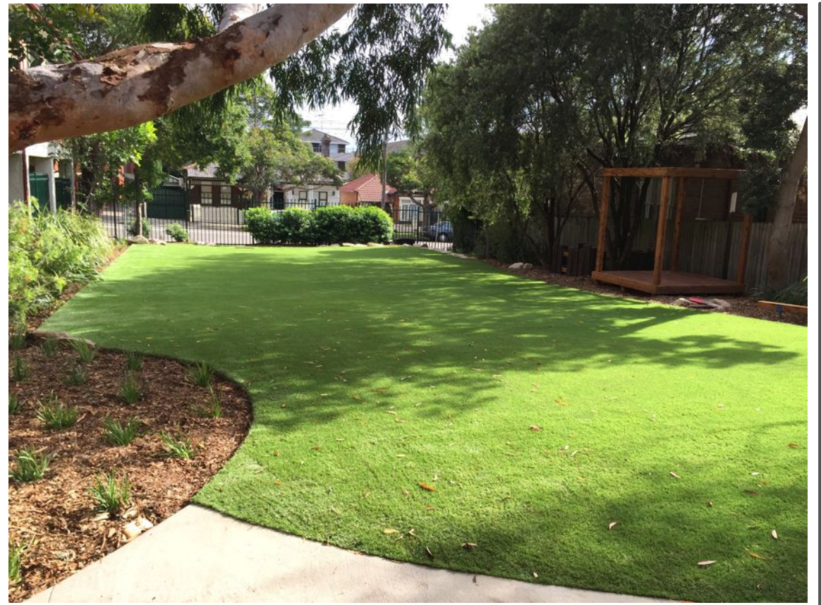
Synthetic grass is hard wearing and can easily transform asphalt areas into attractive play spaces