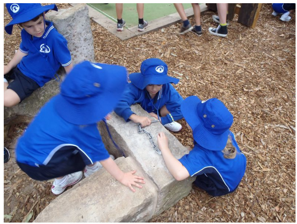
Keep it simple with Rock Grinding!