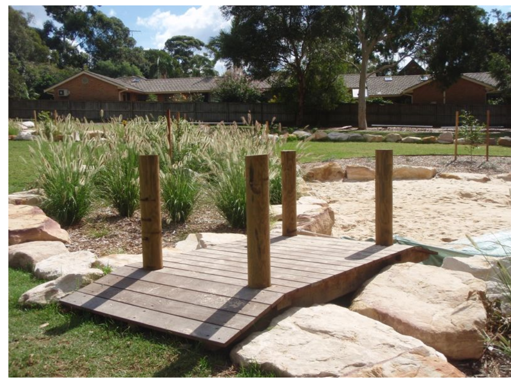
Timber bridge marks the entry to the play sequence