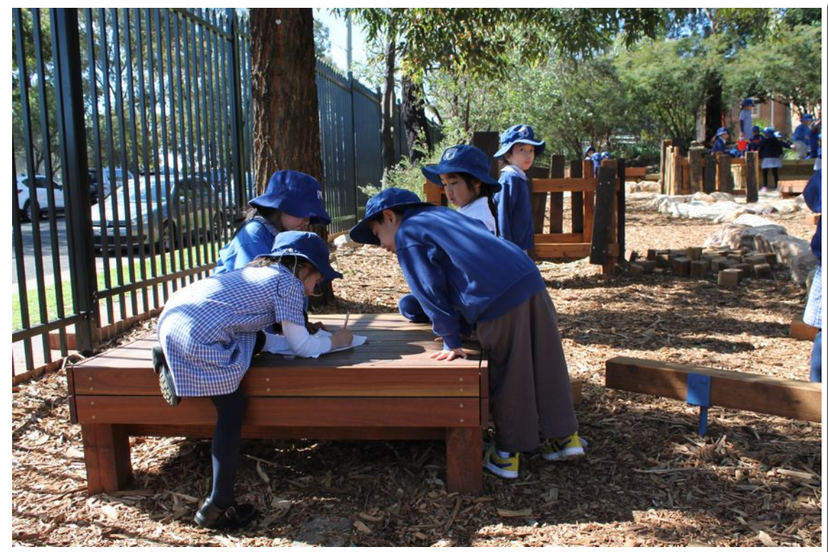
Passive play areas are an important element to every playground