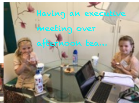
Having an executive meeting over afternoon tea...