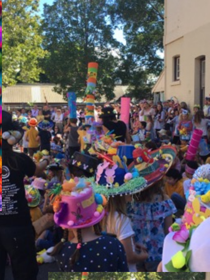
The 3 tallest hats @ BPS