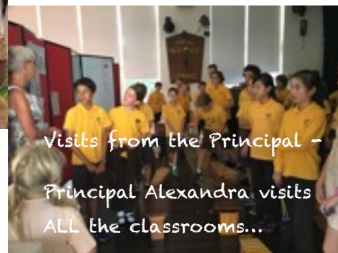
Visits from the Principal - Principal Alexandra visits ALL the classrooms...