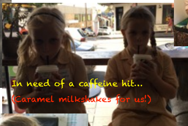
In need of a caffeine hit... (Caramel milkshakes for us!)