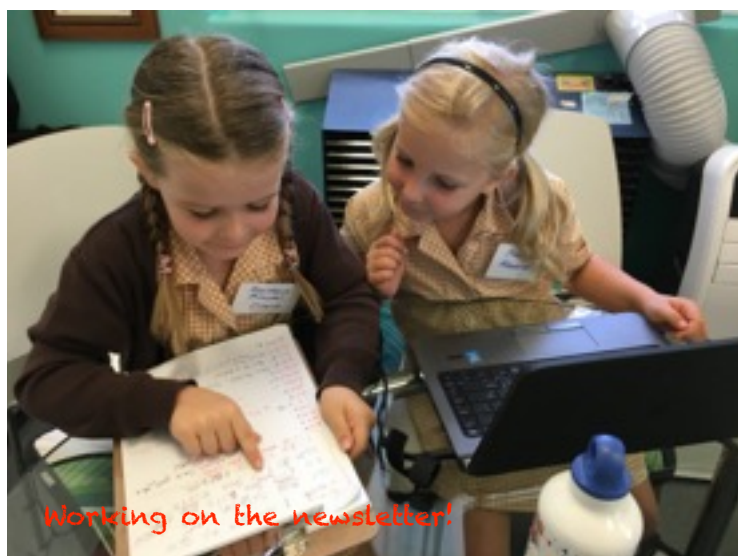
Working on the newsletter!