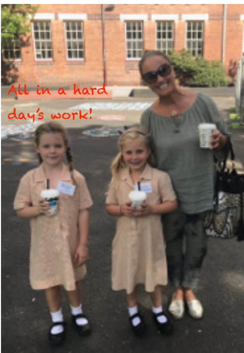
All in a hard day's work!