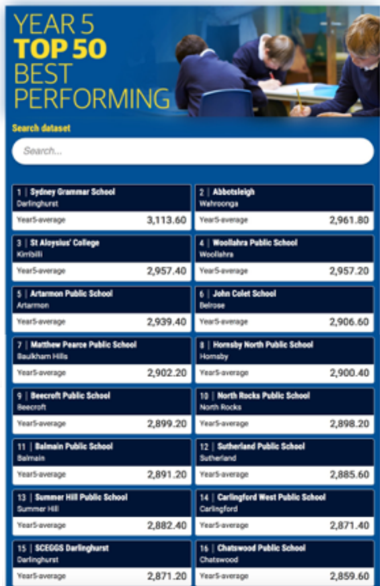
Inner City Sydney, NSW - NAPLAN Results Five-Year Average