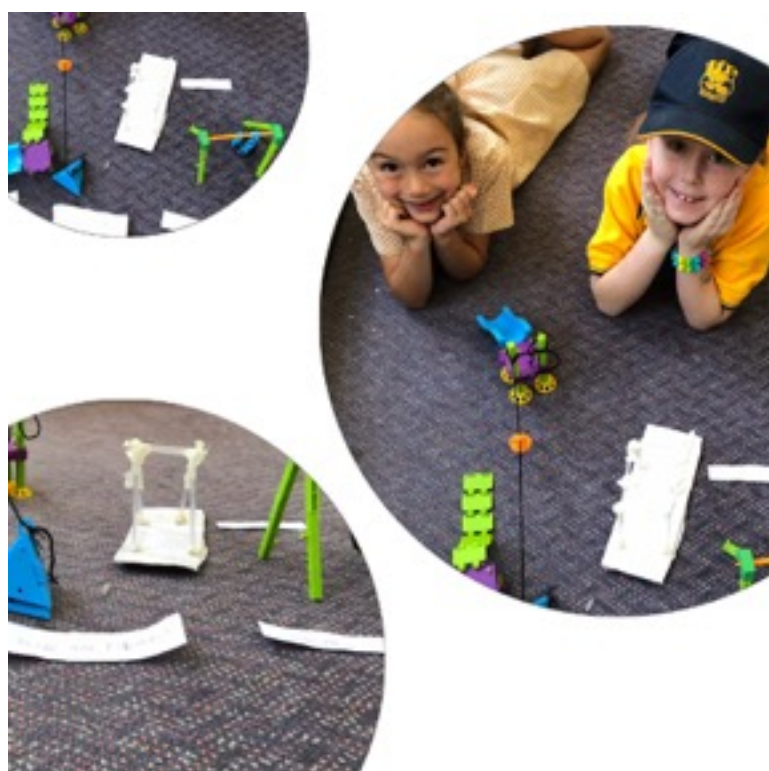
Eliza and Sienna learnt about a birds eye view and made a model of the equipment in Gladstone Park.