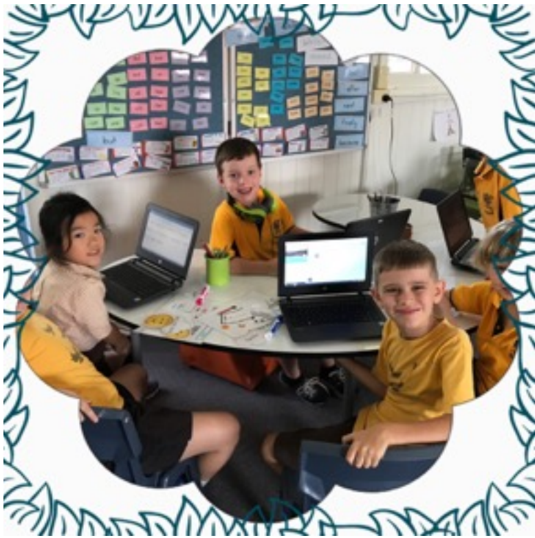
Learning about Geography using Google Maps and Google Earth...