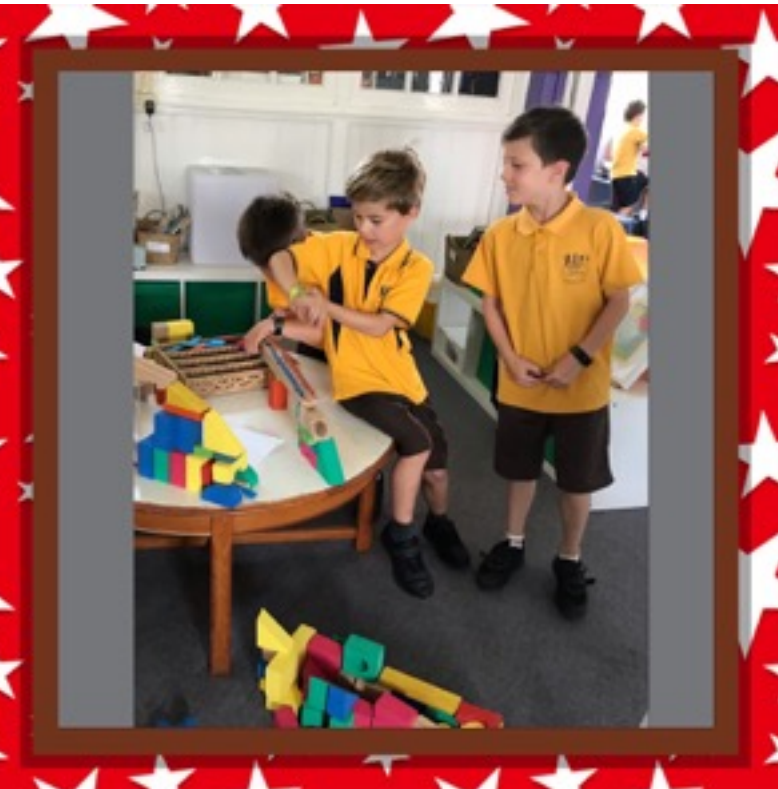
Jack, Elliot and Oscar. "We are building a marble track with three ways that meet together."