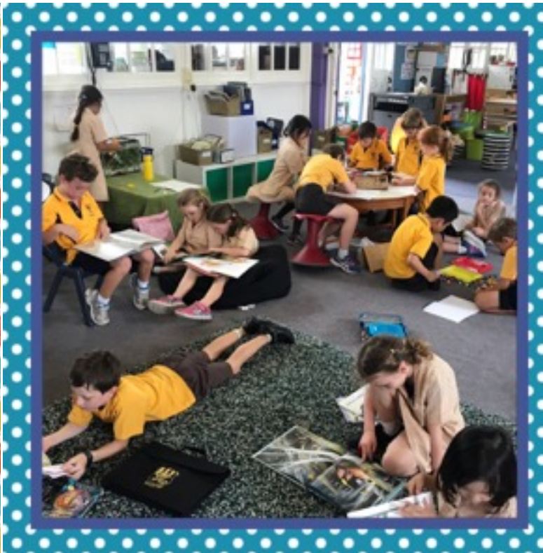
Arabella and Eve buddy-reading a book!